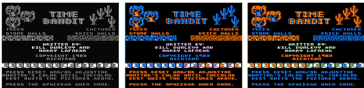
Figure 5.2: Time Bandit , Dunlevy & Lafnear, 1983 in different artifact modes

Try pressing Ctrl+A one or more times. What this really means is that you’re used to running the program on an NTSC machine, and it makes use of cross-colour, but XRoar is emulating a PAL machine. Try starting with -default-machine tano or -default-machine cocous .