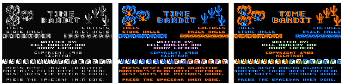
Figure 5.2: Time Bandit , Dunlevy & Lafnear, 1983 in different artifact modes

Try pressing Ctrl+A one or more times. What this really means is that you’re used to running the program on an NTSC machine, and it makes use of cross-colour, but XRoar is emulating a PAL machine. Try starting with -default-machine tano or -default-machine cocous .